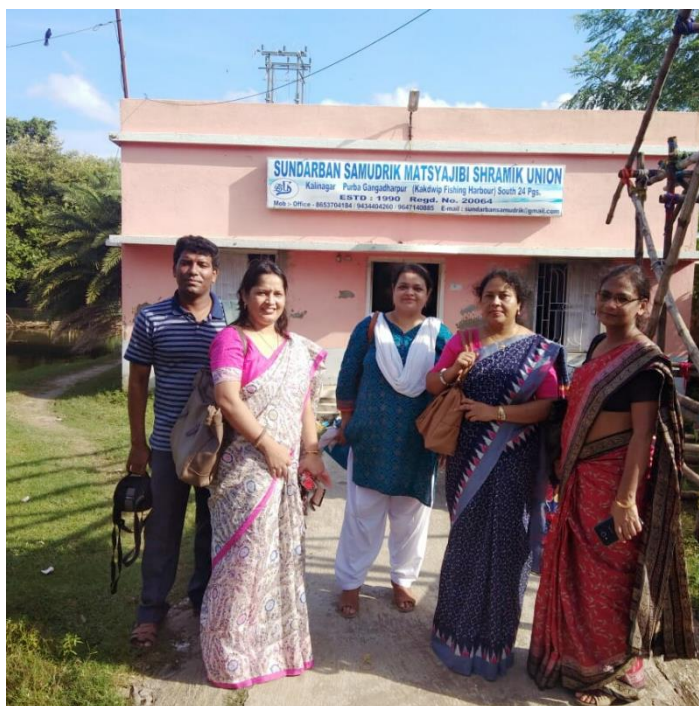
Faculty of Netaji Nagar College for Women, Kakdwip Fishing Harbour (Jahnavi) on 30 th September 2019